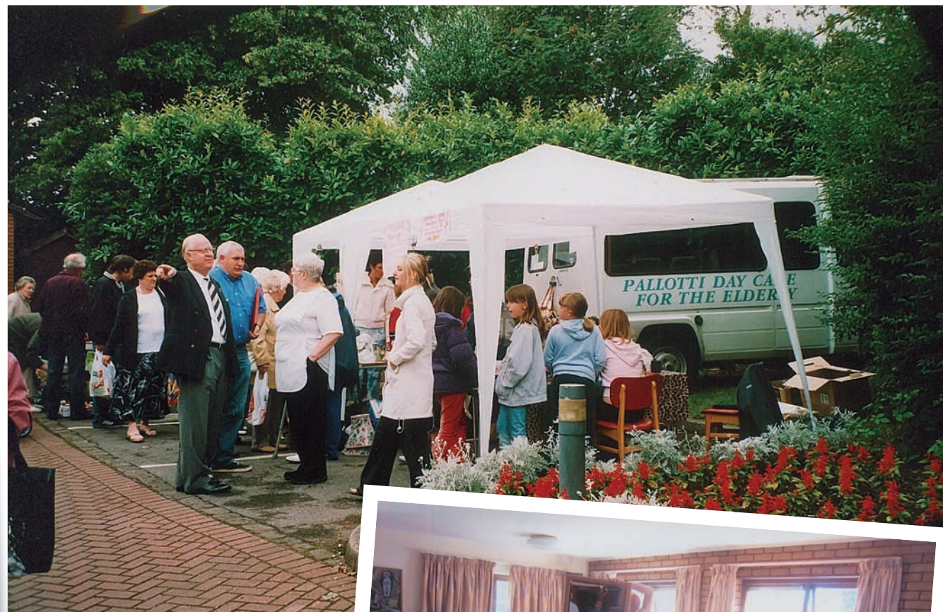
Garden Party (above), and Auction to raise funds for the Day Care Centre