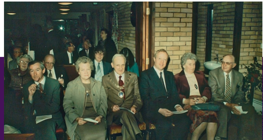
Staff and visitors at the opening ceremony