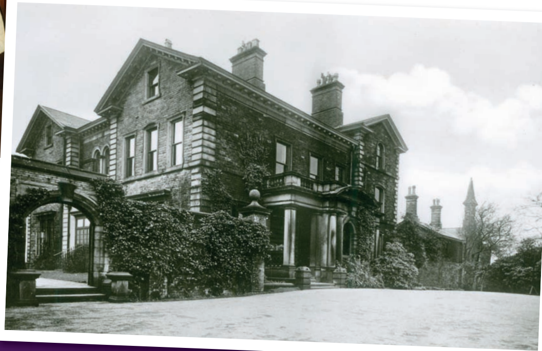
Beechwood Convent High School