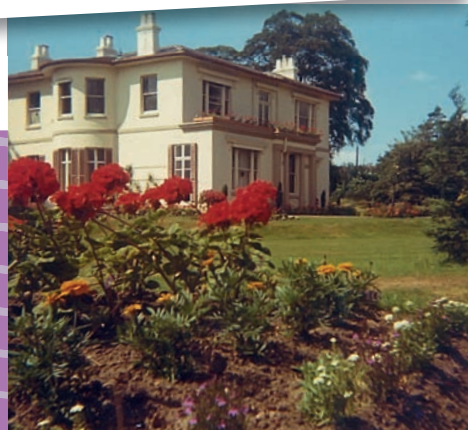
The original house and gardens

By the time ownership was transferred to the sisters the building had been vandalised and had fallen into extreme disrepair. It was decided the cost would be too great to renovate the original building and a decision was made to demolish and build a purpose specific Residential Care Home.